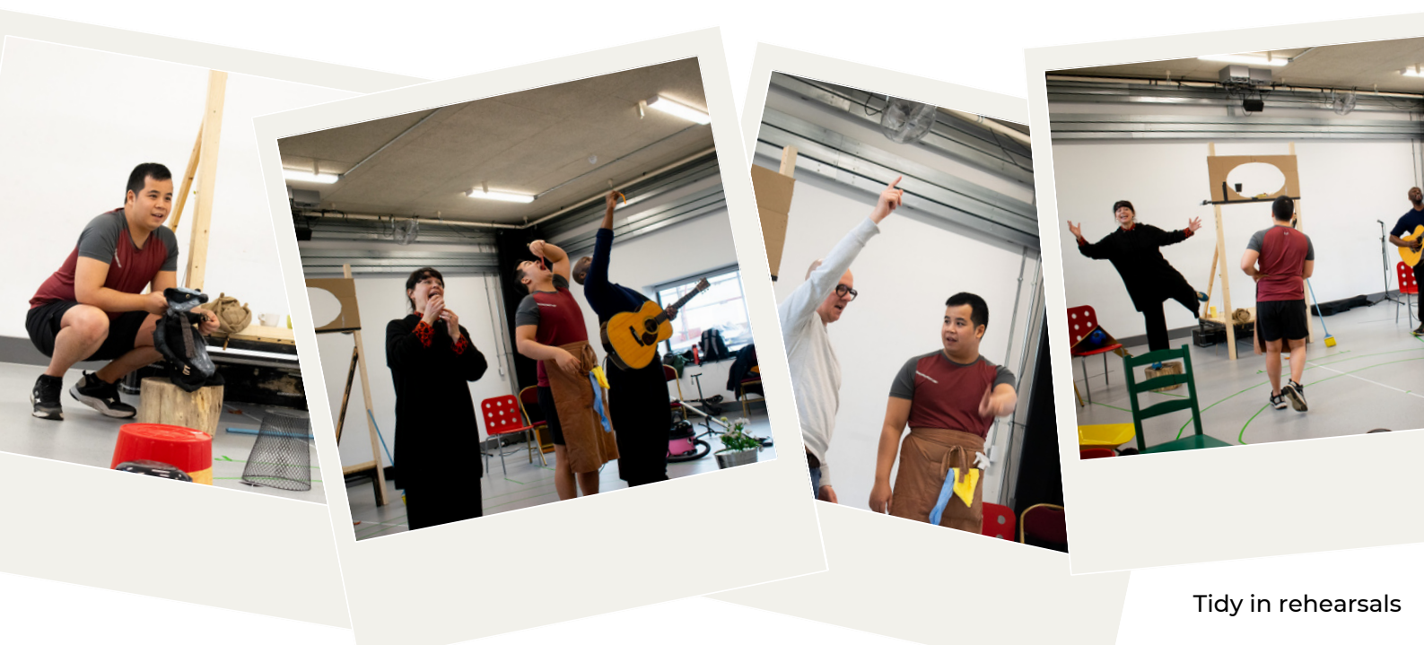
Tidy in rehearsals