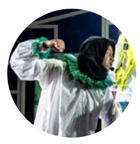
Montague Family Member