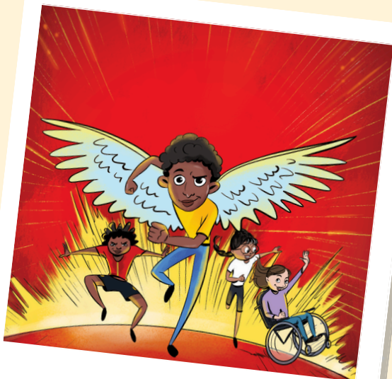
The Boy With Wings